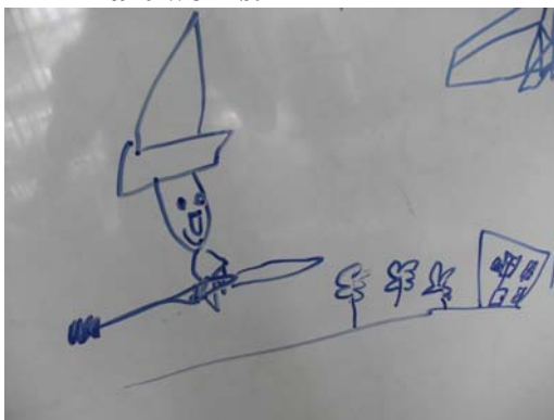
Witch, hat, broom-Yuya (Pointy hat)