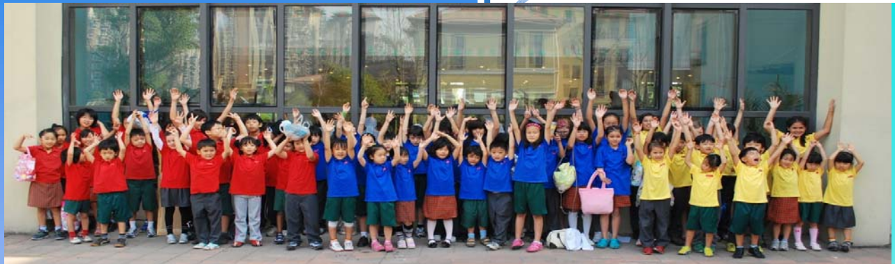
Spot the Year 1 students amongst the whole school! From left to right, Han, Tang and Min houses just before heading to the pool!