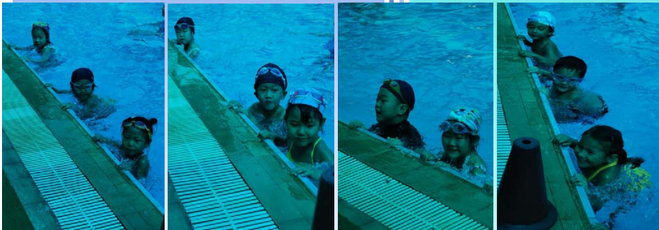
Some of the Eager Beavers competing in the Monkey Race! They were so fast! ☺

Now check them out in their kickboard races: